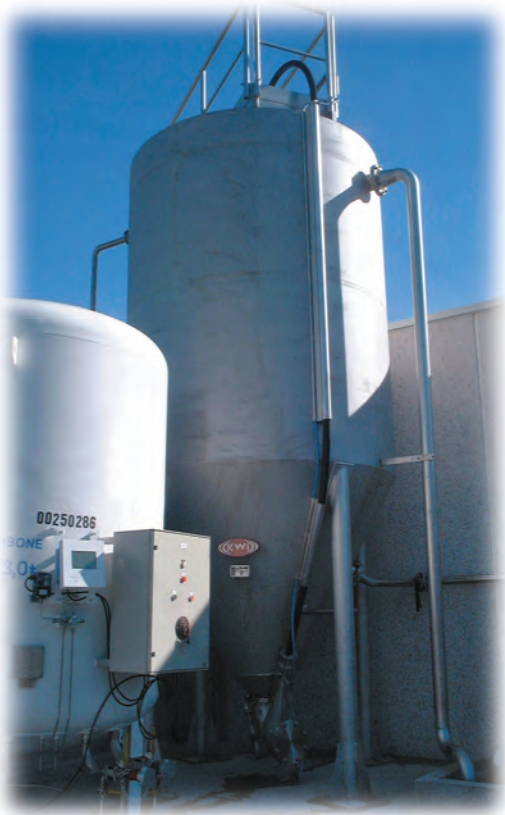
KSF 5-2 - Tertiary treatment dephosphorylation