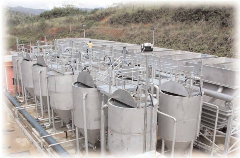
KSF 5-1 - Turnkey drinking water project