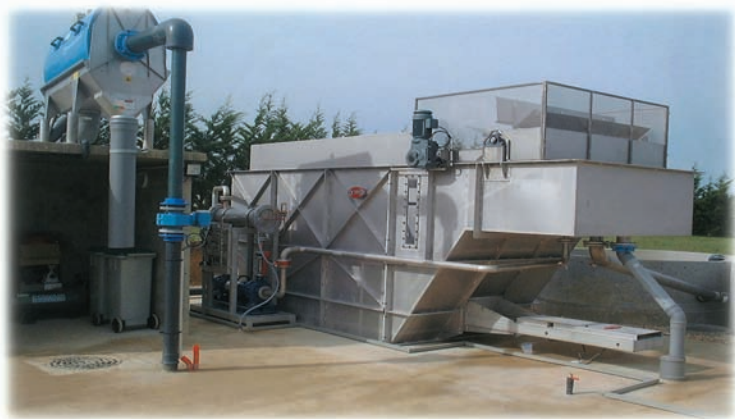
UNC 50 - Fats removal food industry