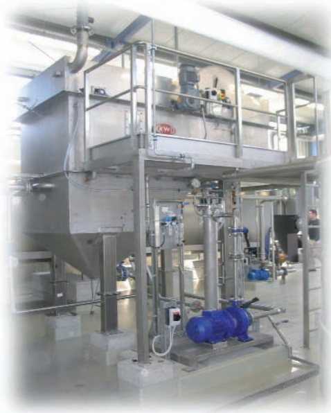
UNC 15 - Fats removal food industry